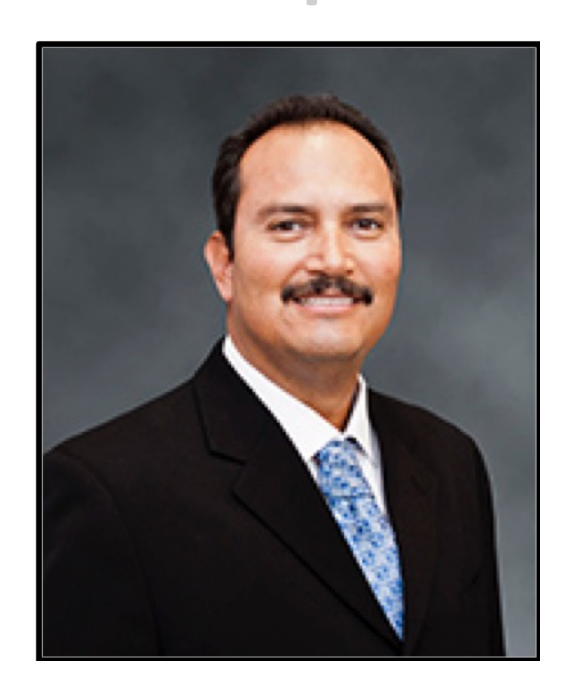
CSHO, SHEP, Safety Manager KPost Roofing & WATERPROOFING RHCA Safety Council